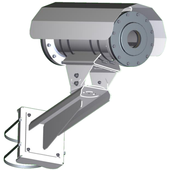
Figure 2 - BEX-6620 Housing w/ BEX-SS-66205 Sunshield, BEX-WMT Wall Mount, and BEX-PM Pole Mount