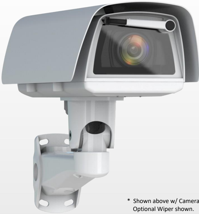
* Shown above w/ Camera (not included). Optional Wiper shown.

The BEH-5160 Series camera housings offer an extra-large equipment bay, a full feature set, and installer friendly design. Side-opening access to the camera bay simplifies installation and camera servicing without disrupting the camera's field of view. 24VAC or PoE+ input voltages power the heater, blower, and camera.